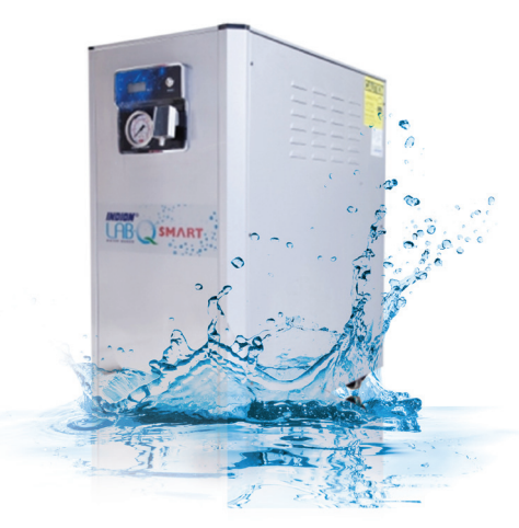
Capacity: 50 LPH