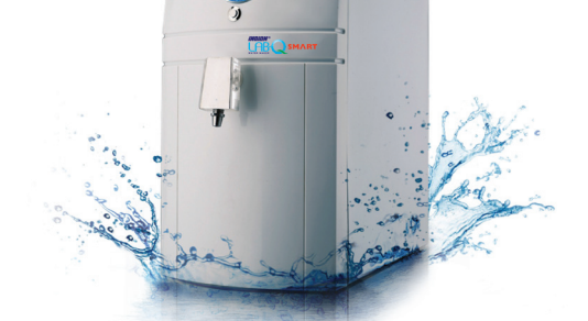
Capacity: 10 LPH

Ion Exchange with over five decades of experience in innovative total water management solutions, presents INDION Lab-Q Smart (Type 2) Water Maker. It produces pure water which is essential for creating chemical reagents, microbiological buffers and media that are consistently pure. It is an excellent source of water for glassware washing and as feed water for laboratory equipment such as autoclaves, laboratory dishwashers and water baths. It is also a recommended source of pretreated water for use in Type 1 ultra pure systems. It produces water with very low Total Organic Carbon (TOC) content and conforms to ISO 3696 and corresponding ASTM standards. Potable tap water can be directly connected to INDION Lab-Q Smart to produce Type 2 pure water. It is easy to install and has several built-in safety features for reliable and consistent Type 2 water supply. For feed water with higher level of TDS i.e.> 500 ppm a customised pretreatment module can be designed prior to INDION Lab-Q Smart.